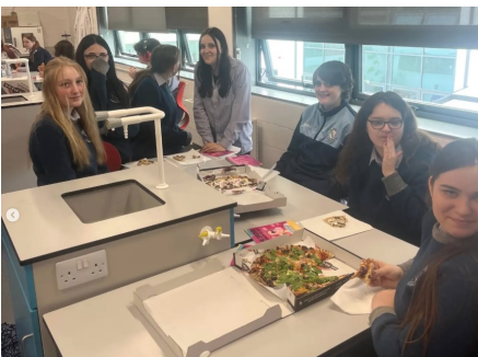
Female Lead Pizza Lunch