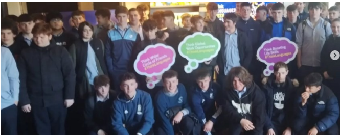
Senior French Film Trip