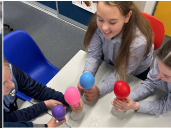
Lunchtime Science Club