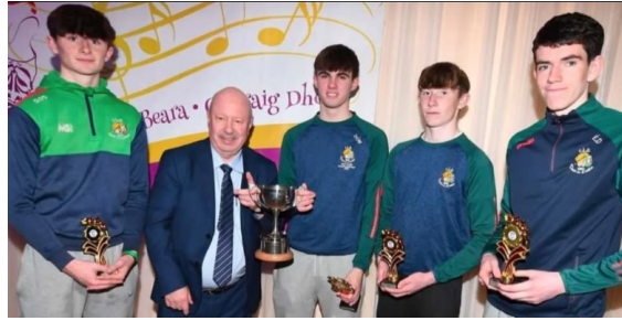
Some CCC students winning Cork Scór na nÓg