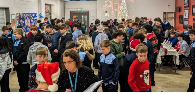
TY Enterprise Task Day