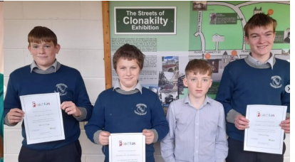
Students taking part in Tráth na gCeist