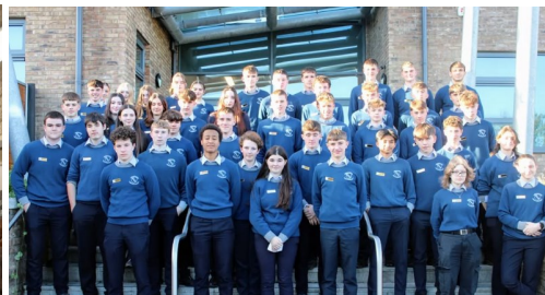
Our amazing Open Night Helpers!