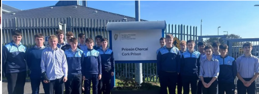
TY Students visiting Cork Prison