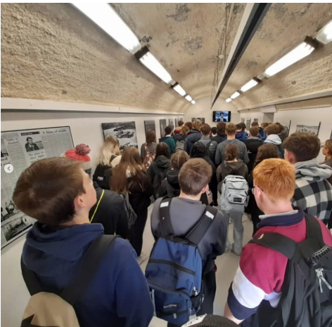
TYs visiting Spike Island