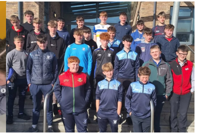
Road Bowling Team 2024