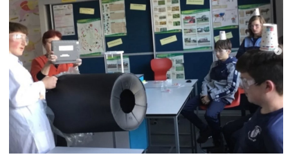
Students from the SNU enjoying a Science Show in one of the labs