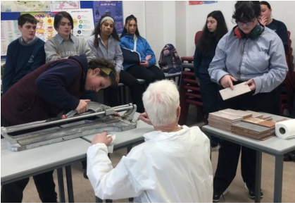
Female Students learning DIY