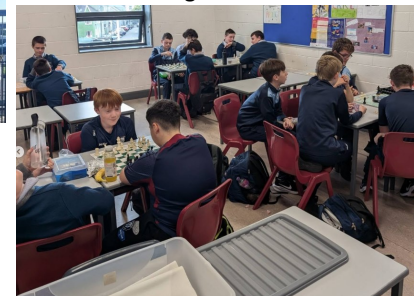
Lunchtime Board Games Club